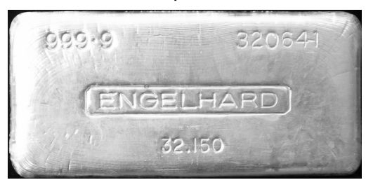
One Kilo Gold Bar 32.15 oz.

First, unless you are the trustee of your self-directed 401K, you cannot physically hold the gold, but will have to hire a certified storage facility. Second, only self-directed IRA's are eligible to contain precious metals. Numismatic and PCGS/NGC certified bullion coins are not permitted for IRAs.