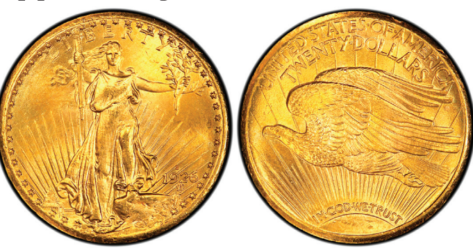
1926-S $20 (Regular Strike) St. Gaudens.

most enjoyable ways to build up your supply of gold while enjoying the numismatic qualities. With prices this low, the potential for value increase is more than just a silver lining. •