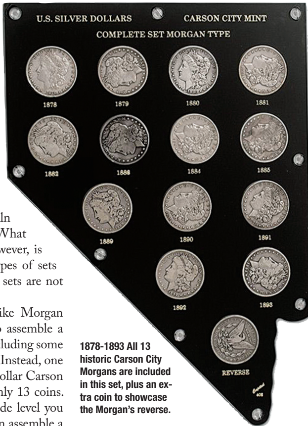
1878-1893 All 13 historic Carson City Morgans are included in this set, plus an extra coin to showcase the Morgan's reverse.

relatively inexpensive in lower grades. A type set is like a year set, but could include different types of coins from different years.