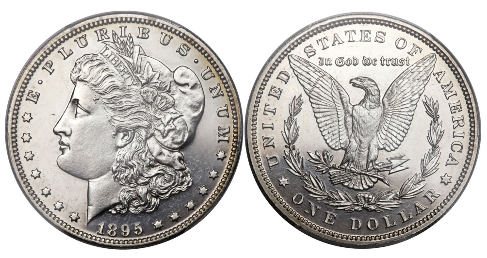
1895 Proof Morgan Dollar