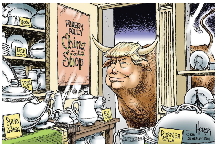
Top of the Ticket cartoon

stronger. A ten ball juggler couldn't manage this!