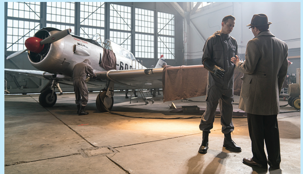
Aidan Gillen (right) as Dr. J. Allen Hynek in HISTORY’s “Project Blue Book.” “The Flatwoods Monster”

and Michael Malarkey. Each episode draws from actual case files blending UFO theories with authentic historical events and delves into themes such as trust, instinct, real news vs. fake news and government cover-up. “Project Blue Book” straddles the world of science and the exploration of the unknown. If you like it half as much as I do, you’ll be glued to the screen for all ten episodes, and hopefully, Season Two! Tuesday nights at 10pm/9c. More details at www.history.com