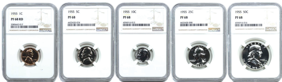
1955 PF-68 Date Set

In addition to their beauty (the aesthetics of having all denominations of a single year should never be underestimated!) date sets present an opportunity with great flexibility insofar as the cost of collecting is concerned. A basic set is only 5 coins. This can be an inexpensive endeavor if confined to lower grade or common coins, but can also be an opportunity to assemble truly high