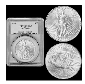
St Gaudens $20 MS-65